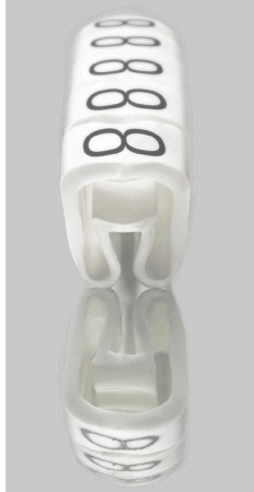
Similar to illustration